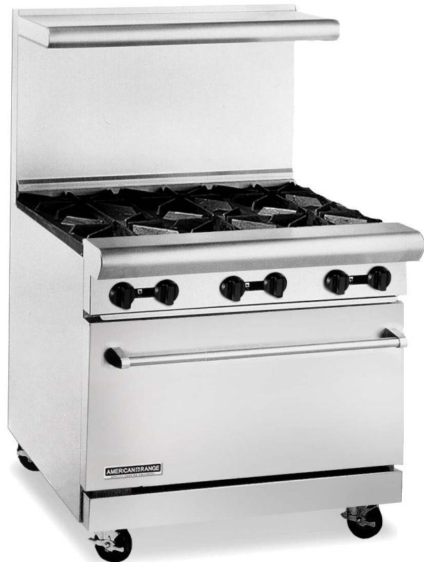
AWR36-6 Shown with optional casters