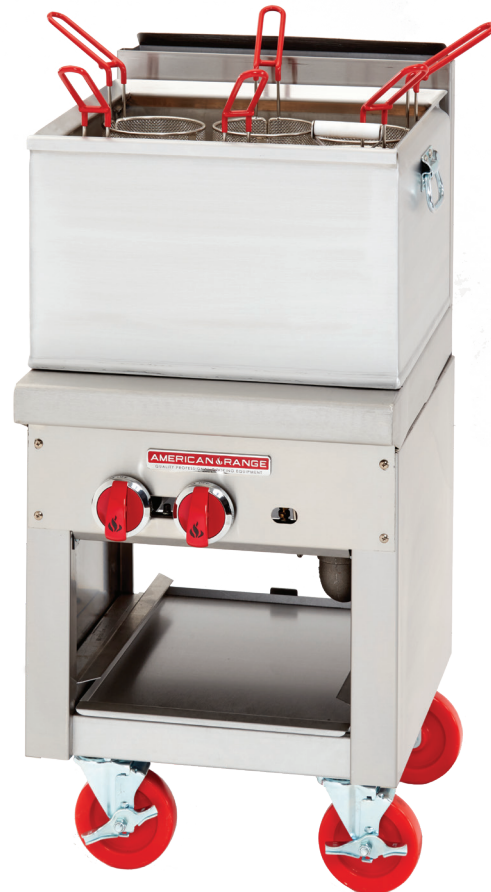
Model ARPC3 Shown with optional casters