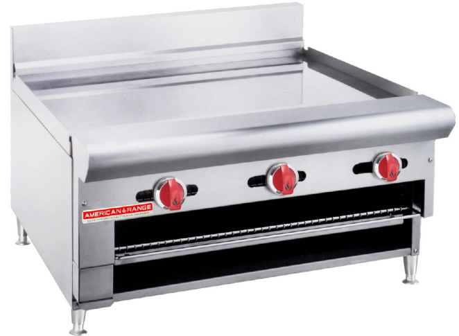
Model Shown ARGB-36