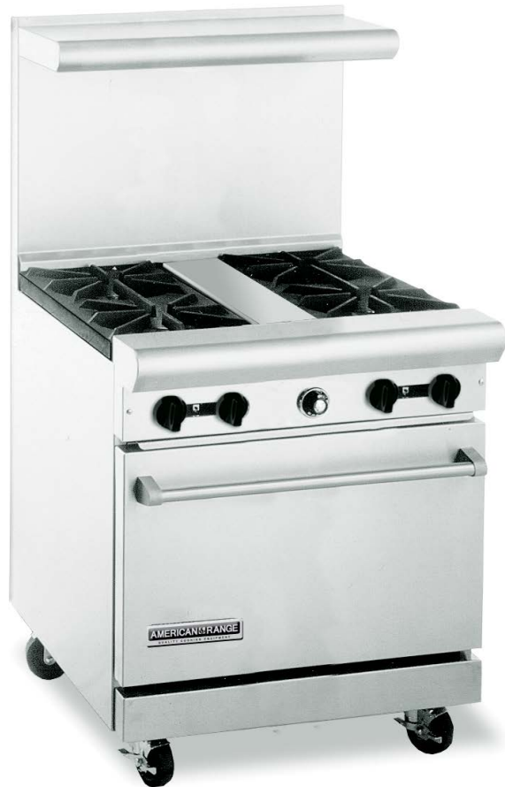
AR30-4B Shown with optional casters